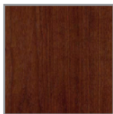
Medium Walnut 121