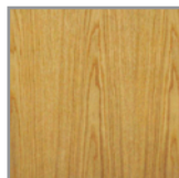
Light Oak 511