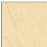
Natural Maple 400